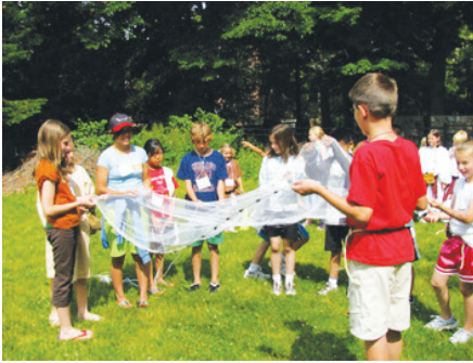
Children learn net tossing at game time.

Vacation Bible School is actually a rotation of three programs. While the basic format remains the same year to year, the dramas, information, and activities focus on different time periods. This year, during Marketplace 27-28 A.D., the emphasis is on Jesus calling his disciples.