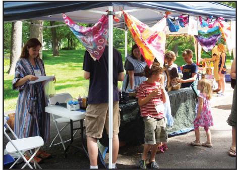
The marketplace is open and ready for business.