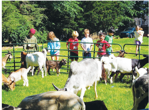
Above left: A student in Synagogue School. Above right: Children enjoy the animals. Below: Children make and eat the famous "Bible school bread" and delicious snacks.