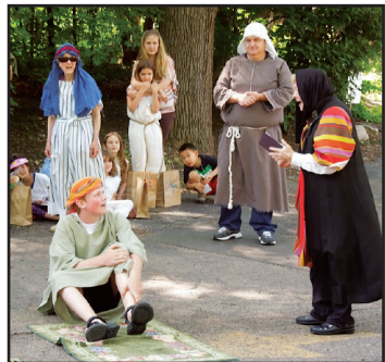
Actors in the marketplace re-enact Bible stories.

Children will be placed in small family groups. Each group consists of children of varying ages, kindergarten complete through fifth grade, from all four churches. A "parent" introduces the family group to the life and customs of families living in Bible times. They travel together to various activities ... visiting the arts and crafts marketplace, attending Synagogue school, participating in dramas based on Bible stories, visiting the storyteller, and more.